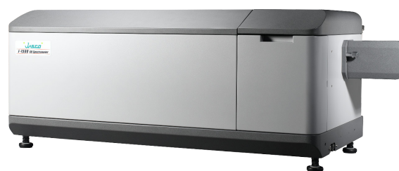
J-1500 CD Spectrometer

Biopharmaceutical and biotech product production is a long process that entails years of research, development, and clinical trials. These phases demand rigorous chemical stability studies for optimization of dosage and product scale up, as well as suitability of product packaging. Circular dichroism (CD) is a commonly used technique in the pharmaceutical and food science industries for structural characterization of biomolecules. Changes in spectral data could indicate a loss in stability or change in structure, corresponding to inhibition of the biomolecule's function. Differentiating between true structural changes, or differences in spectra due to instrument noise or general sample-to-sample variation, should not be left to the user's discretion.