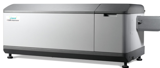
JASCO J-1500 CD spectrometer View product information at www.jascoinc.com

This application note highlights the features of the JWSEE-513 and JWMVS-529 Secondary Structure Analysis programs.