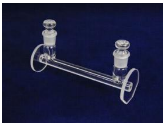
Fig.1 Cylindrical Cell 2.5